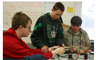
Students at ICC working on their robotics project