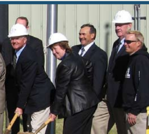
Sen. Franken joined local officials and business leaders at the groundbreaking for the Itasca Economic Development Corporation Industrial Park in Grand Rapids on October 14, 2010.

Beyond marketing activities and site visits from prospective tenants, much of 2010 was dedicated to cleaning up the Itasca